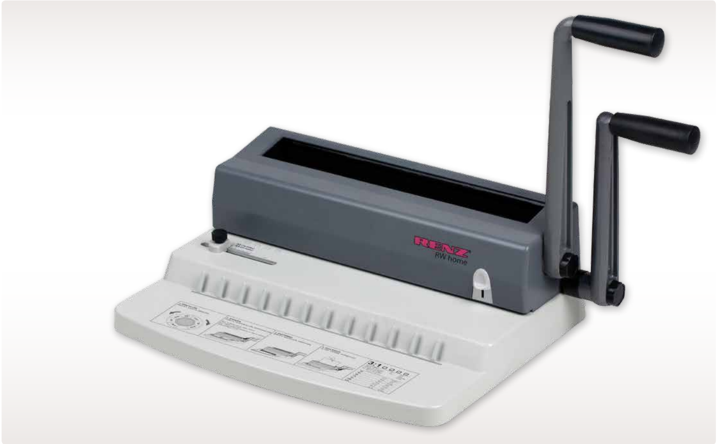
Illustrated: RW home

Entry-level desktop home range for punching and RENZ RING WIRE® binding. For use with low volumes of books at home.