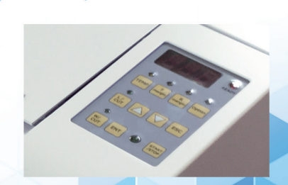
Easy to operate digital panel.

Simple access from the top for quick and easy film roll change and roller cleaning.