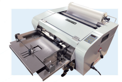
High capacity auto-feed eliminates need to insert one at a time.

Now there's a fully automatic laminator for business professionals and copy/print shops to meet high productivity demands. The Revo-T14 with automatic feeding, laminating and cutting offers high speed and convenience with one touch of the start button. With the roll film process and simple operation, the Revo-T14 laminator saves labor costs, time and increases productivity.