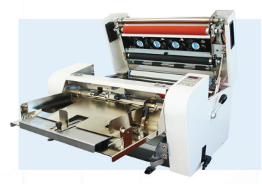
Film change is easy - with top loading system.

Simple access from the top for quick and easy film roll change and roller cleaning.